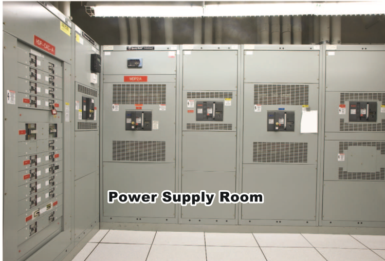
Power Supply Room