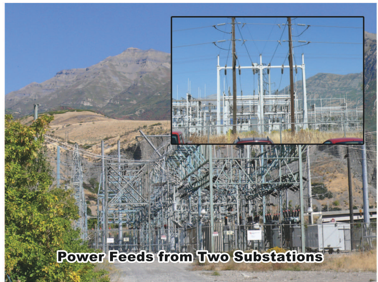
Power Feeds from Two Substations