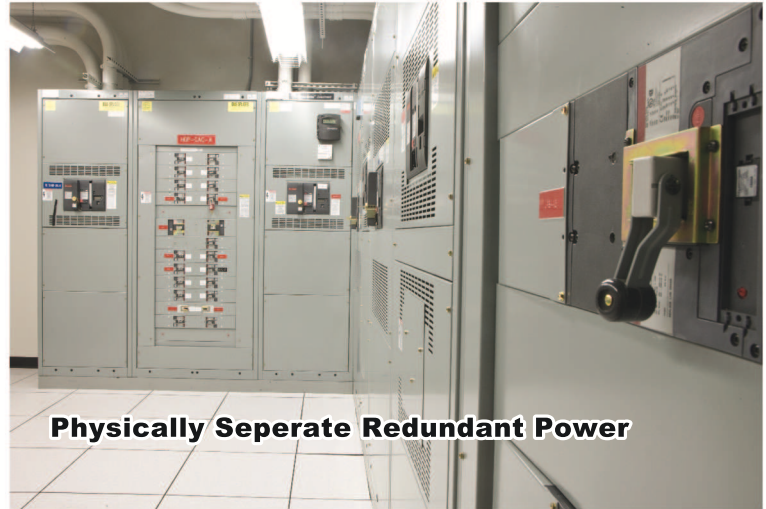
Physically Seperate Redundant Power